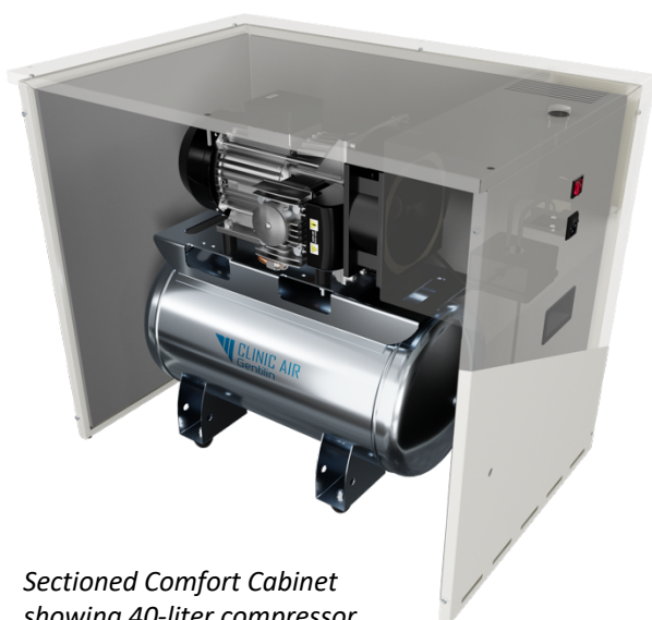
Sectioned Comfort Cabinet showing 40-liter compressor